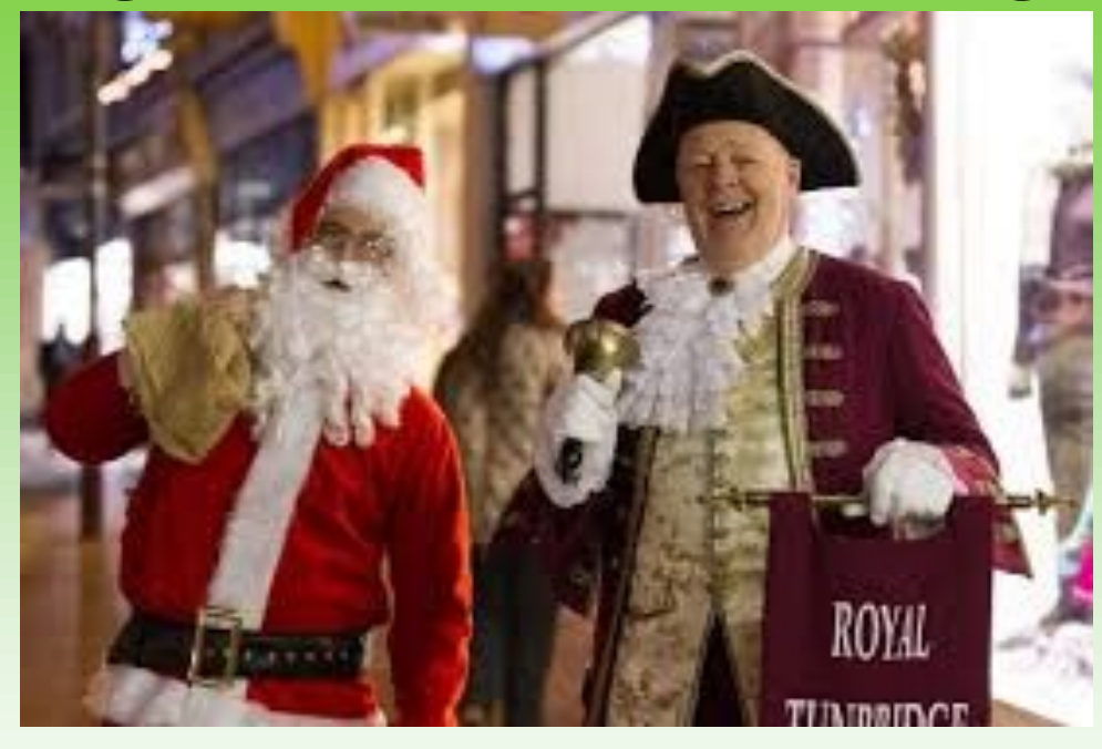
Hello CCC Members-

'Tis the season! As I write this everyone is busy managing Thanksgiving leftovers and cataloging all the fond Memories of yesterday's feast. Next up, Christmas decorating and working up all the Club events that will transpire over the next month or so.