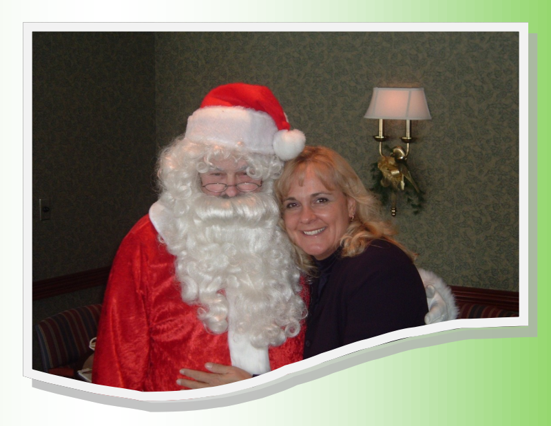
From the Pro Shop: