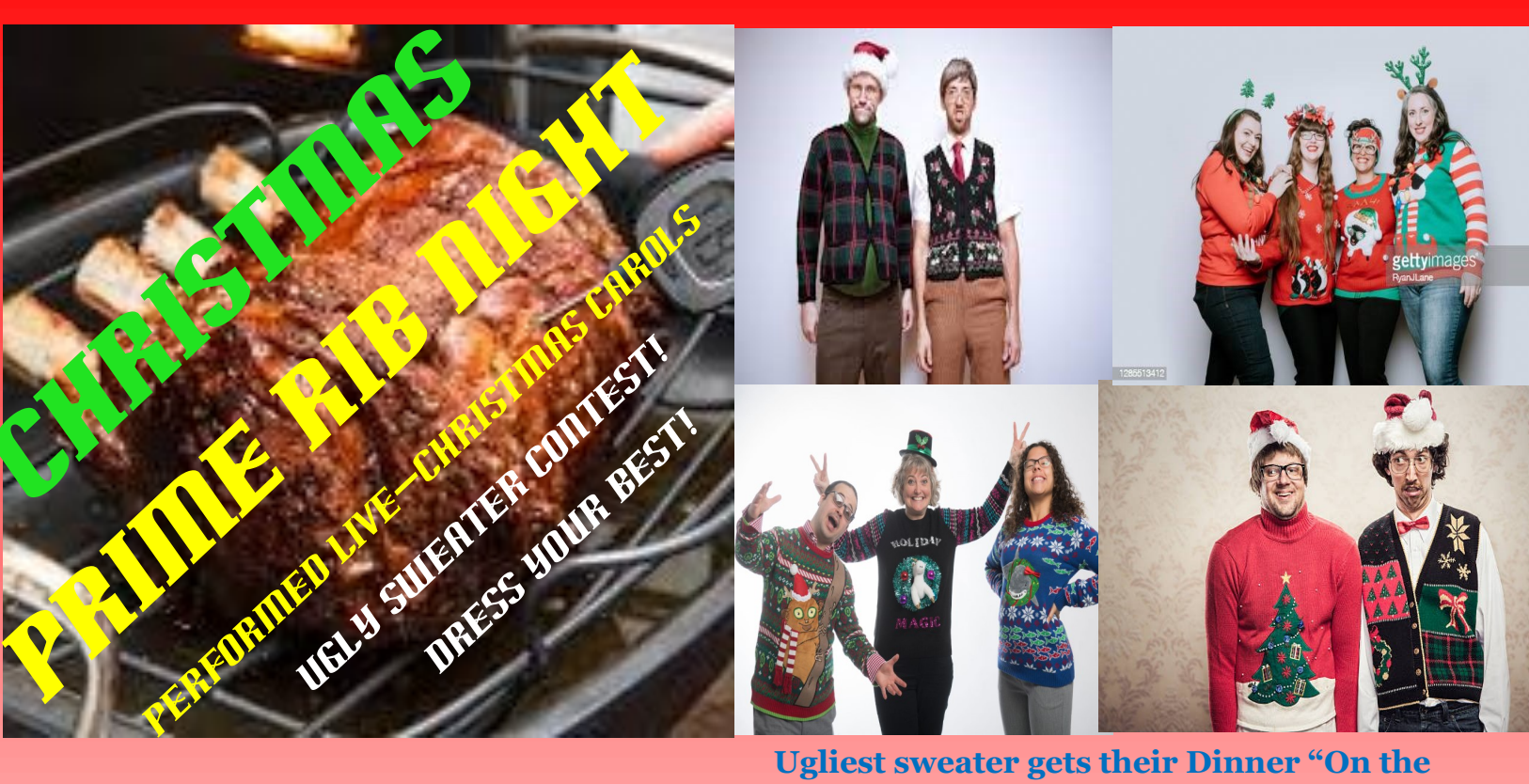
Ugliest sweater gets their Dinner "On the House"! (Voted on by the Staff)