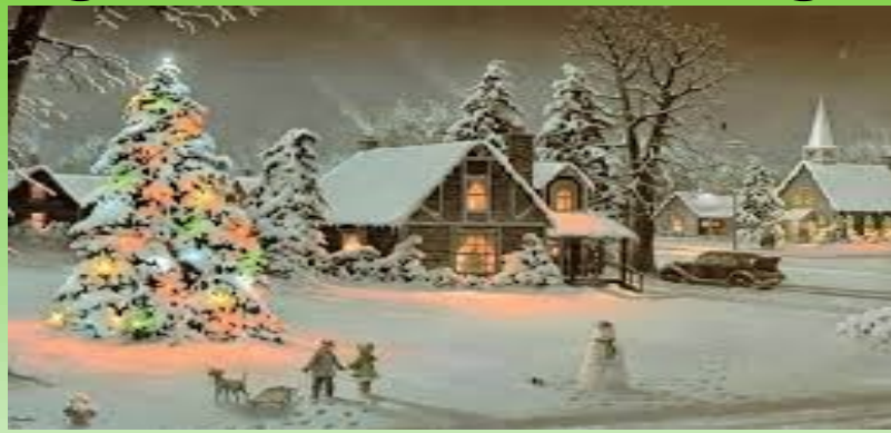
Happy Holidays, CCC Members,

We look forward to the month of December and all the joy we can help bring your families. We are going to be removing some of the summer season specialties such as Chicken Salad, Tuna Salad, Fish Tacos, and Fruit Cups and replace them with items such as a Winter Salad, Lamb Chops,